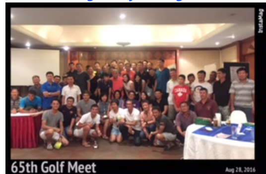
65th Golf Meet