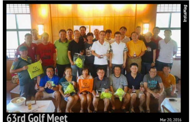
63 rd Golf Meet

40 players came to chase the little white ball :)